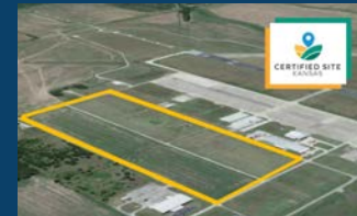
Independence Industrial Park - SW 217.8 Acres