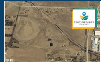
Cherryvale Industrial Park 65.56 Acres

We have FOUR certified Sites, which is more than any other county in the state! A 5th location (Coffeyville Industrial Park) is pending state certification; Caney site is currently under phase 1 environmental review. Certified sites are shovel ready and primed for development.