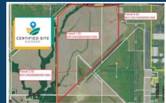
Independence Industrial Park - NW 225.98 Acres