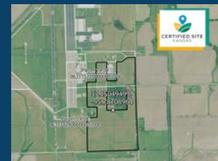
Independence Industrial Park - S 129.48 Acres